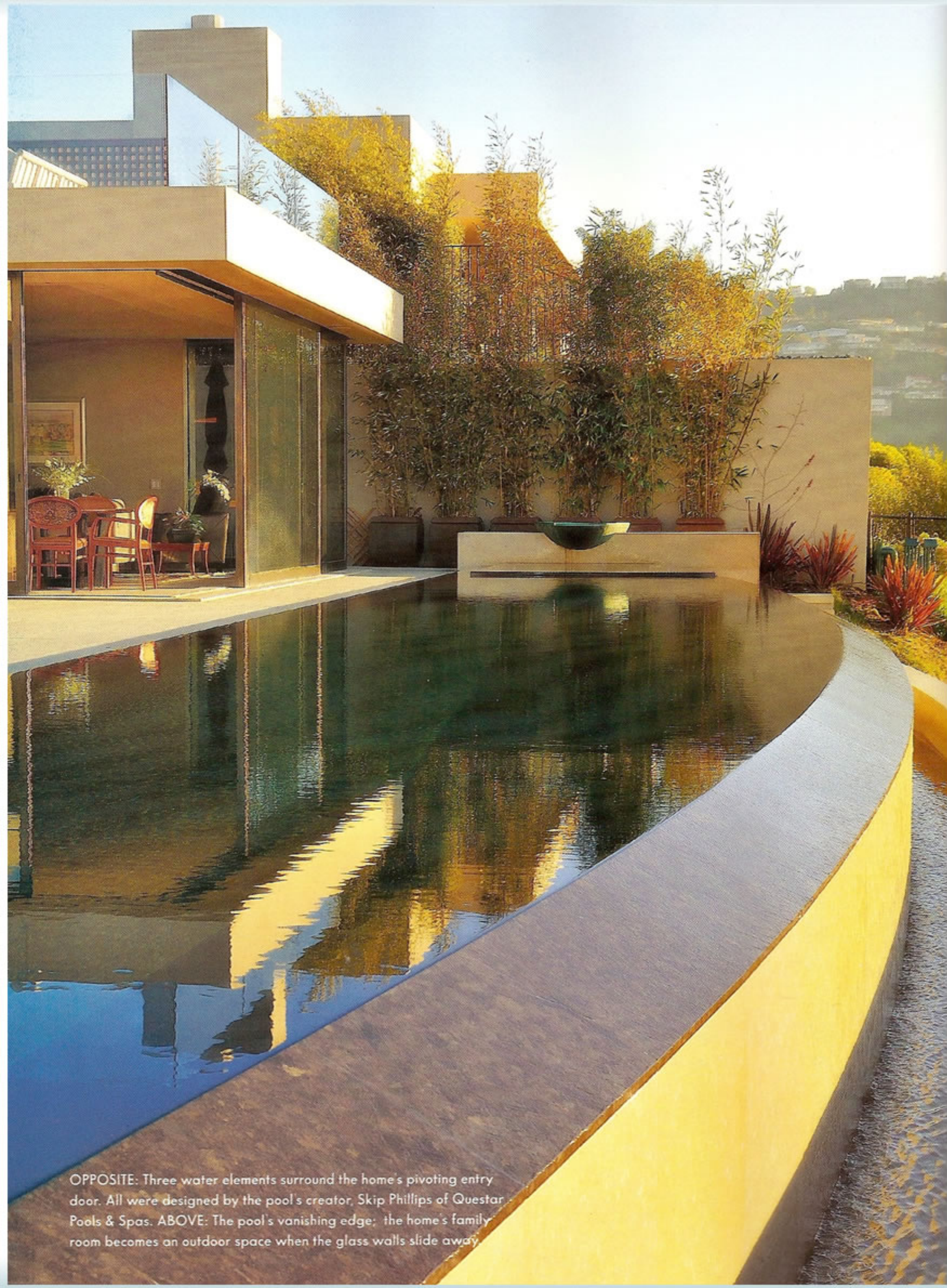
OPPOSITE: Three water elements surround the home's pivoting entry door. All were designed by the pool's creator, Skip Phillips of Questar Pools & Spas. ABOVE: The pool's vanishing edge; the home's family room becomes an outdoor space when the glass walls slide away.